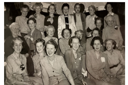
Christian Science Nurses, 1955

But, survive it did, as those who felt the healing atmosphere told others, and the existence of Wayside House became known across the Pacific Northwest. Wayside continued to grow and expand until in 1953, when the home at 550 Foul Bay Road was purchased and renovated into a 32- room structure. The name "Wayside House" is perpetuated.