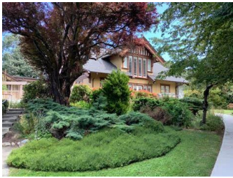
Wayside House 550 Foul Bay Rd. Victoria, BC V8S 4H1 www.waysidehousevictoria.org